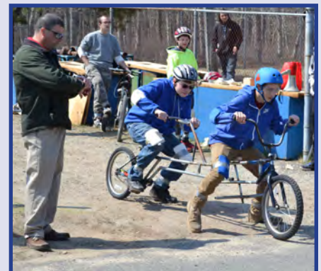
Students showcase their creativity as they race their vehicles during the 2014 Recycle Rally