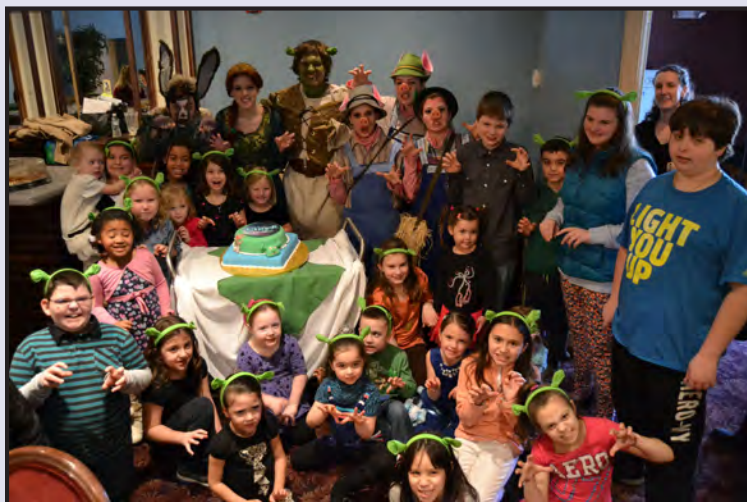
Shrek, Fiona and a host of characters joined young theater guests for an entertaining morning and buffet lunch.