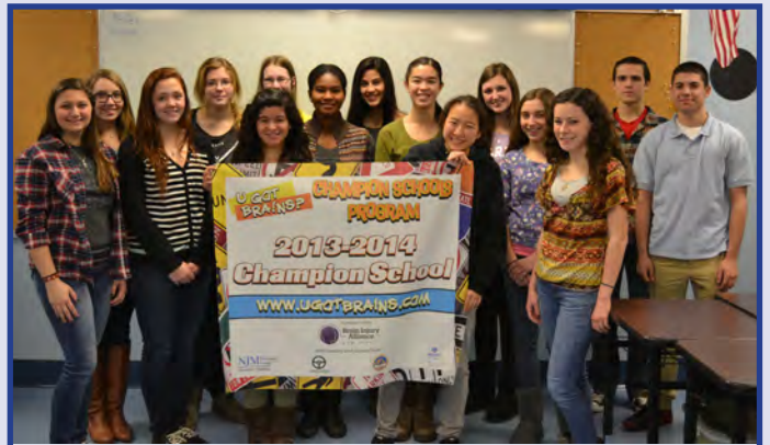
MATES students are prepare their safe driving campaign, "Focus on the Drive from the Passenger's Side."

Winners of the challenge receive a driving simulator for their school as well as a cash grant to fund an 'After Prom' party as well as a school presentation about the dangers of distracted driving.