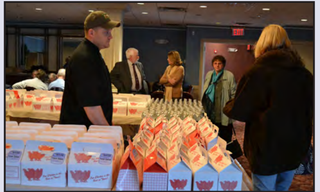
Theater guests enjoyed a delicious box lunch, prepared by Culinary Arts students from the Brick Center, prior to the Senior Citizen Dress Rehearsal Matinee.

A special Shrek & Friends Character Lunch was held prior to the 2PM matinee on Saturday March 1. The event, hosted to attract young people to the theater, included lunch, prepared by Culinary Arts students from the OCVTS Waretown Center, goodie bags and visits from Shrek and his fairy tale friends. The Gallery at the Strand was filled to capacity.