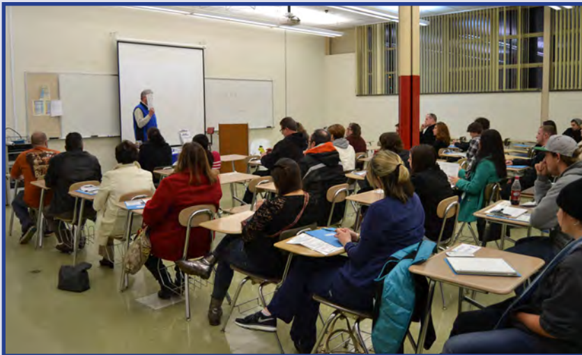
Adult students attend a Special Information Session about accelerated training programs.

For more information about these exciting new programs visit www.ocvts.org .