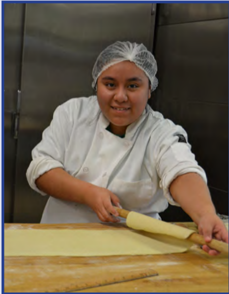
Students showcase their skills and creativity during the SkillsUSA Competition and Open House