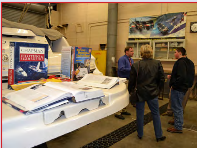
Students and instructors showcase their programs during the Annual Open House